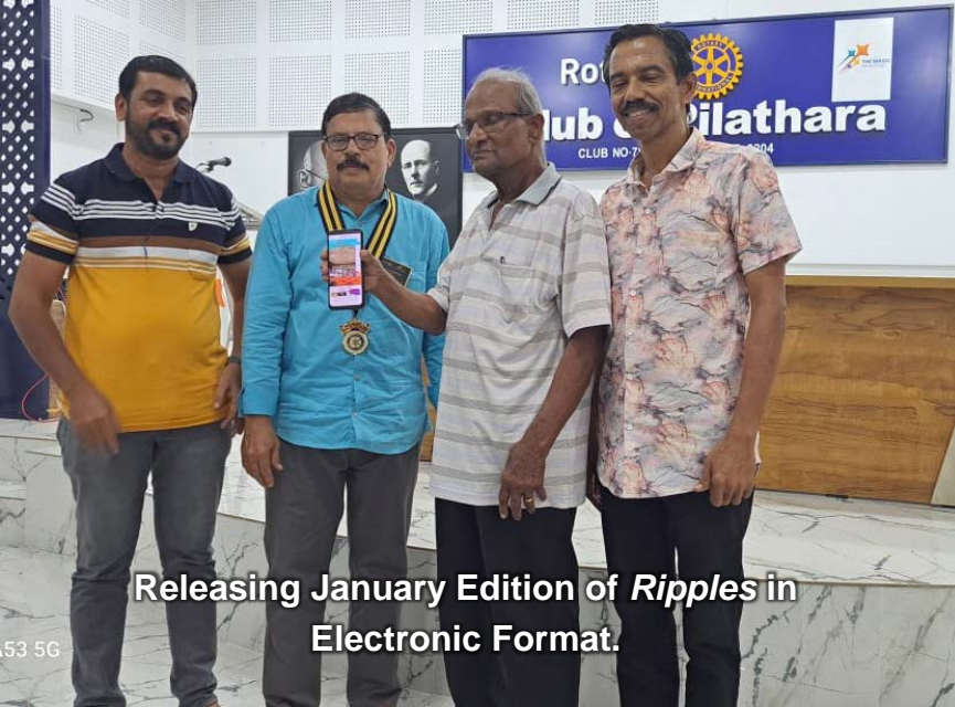
Releasing January Edition of Ripples in Electronic Format.