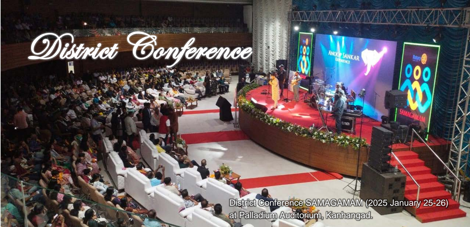
District Conference SAMAGAMAM (2025 January 25-26) at Palladium Auditorium, Kanhangad.

"Samagamam" – District Conference 2025, held on 25th and 26th January 2025 at Palladium Convention Centre, Kanhangad, was truly a landmark event, bringing together Rotarians and professionals for leadership, knowledge sharing, and community service.